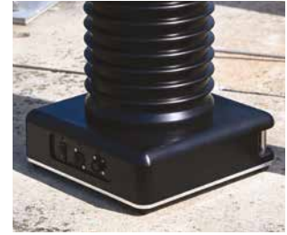
Bottom view: Control & data connections

Operating voltage (sine wave) max. 68 kV peak , 48 kV rms