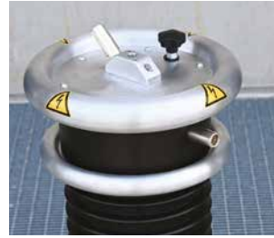
Top view: HV connections

Test setup and calibration according to IEC 60270. Additionally, TD testing according to IEEE 400.2.